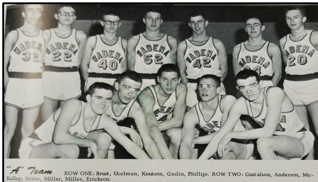
1958-59 WHS Indians